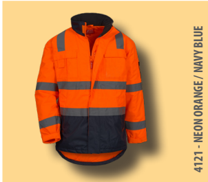
4121 - NEON ORANGE / NAVY BLUE