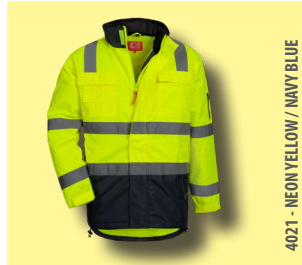
4021 - NEON YELLOW / NAVY BLUE