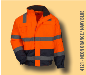
4121 - NEON ORANGE / NAVY BLUE