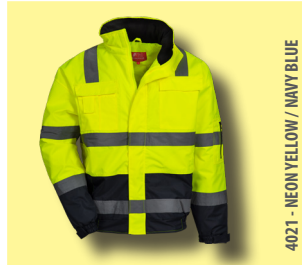
4021 - NEON YELLOW / NAVY BLUE