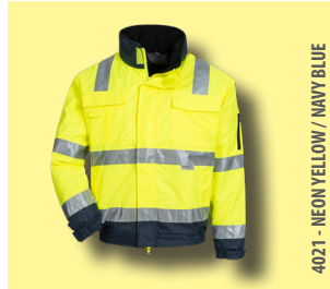
4021 - NEON YELLOW / NAVY BLUE