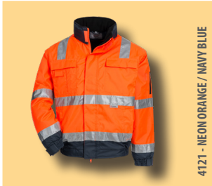
4121 - NEON ORANGE / NAVY BLUE