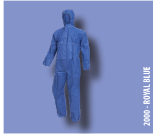
2000 - ROYAL BLUE