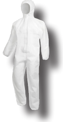
1100 - WHITE